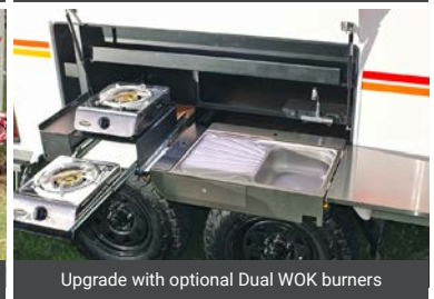
Upgrade with optional Dual WOK burners