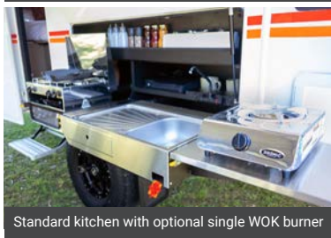
Standard kitchen with optional single WOK burner