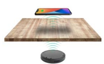
Wireless benchtop USB charging