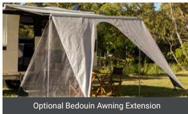
Optional Bedouin Awning Extension