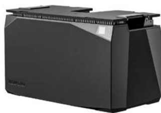
5000Wh SMART 48V Battery