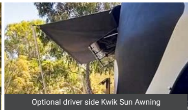
Optional driver side Kwik Sun Awning