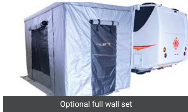
Optional full wall set