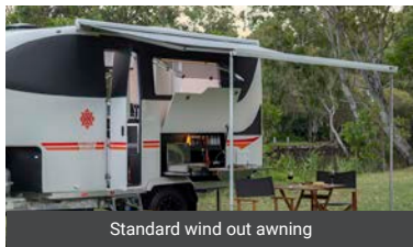
Standard wind out awning