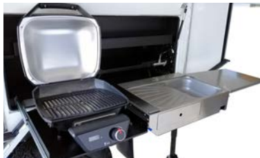
E-Galley Kitchen - Electric Weber® Pulse BBQ