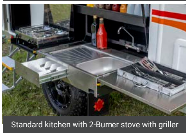
Standard kitchen with 2-Burner stove with grill