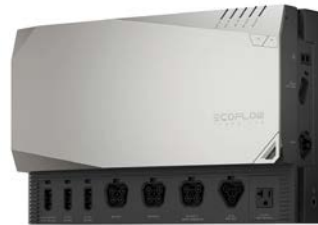
SMART 48V Power Hub with Control Panel