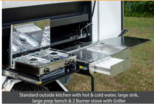
Standard outside kitchen with hot & cold water, large sink, large prep bench & 2 Burner stove with Griller