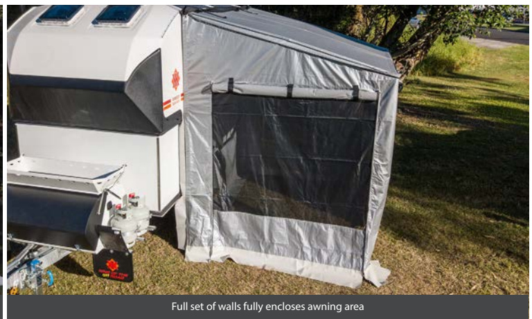
Full set of walls fully encloses awning area