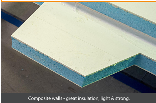
Composite walls - great insulation, light & strong.