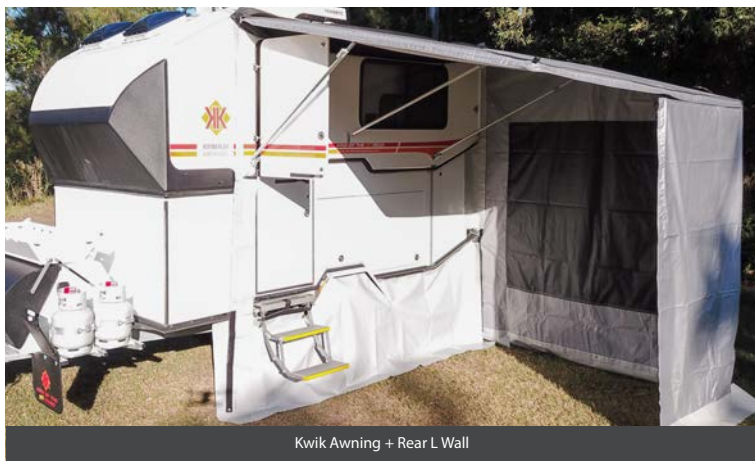
Kwik Awning + Rear L Wall