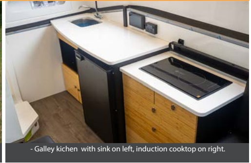
- Galley kitchen with sink on left, induction cooktop on right.