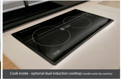
Cook inside - optional dual induction cooktop (model varies by country)