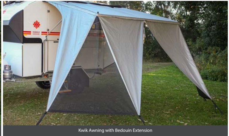
Kwik Awning with Bedouin Extension