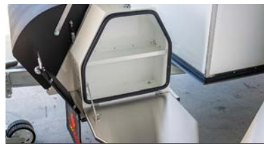
E-No Gas Storage Option - lockable storage