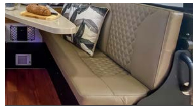
Leather seating with solid surface dining table