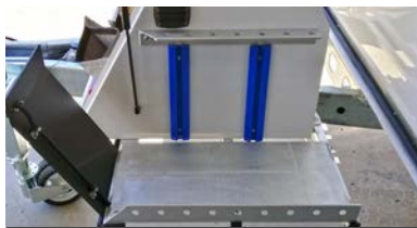
E-No Gas Firewood Option - handy location