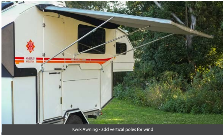
Kwik Awning - add vertical poles for wind