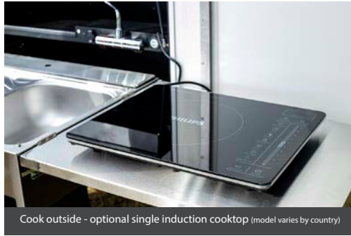
Cook outside - optional single induction cooktop (model varies by country)