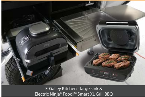
E-Galley Kitchen - large sink & Electric Ninja® Foodi™ Smart XL Grill BBQ