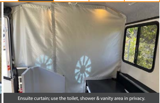
Ensuite curtain; use the toilet, shower & vanity area in privacy.